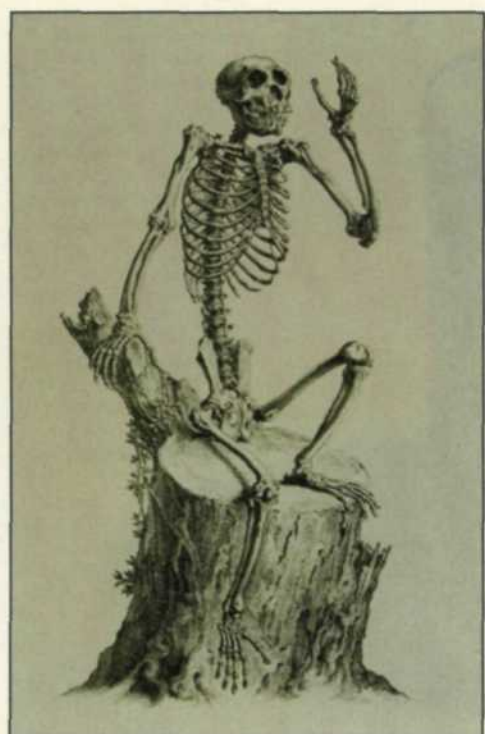
Flat art copy