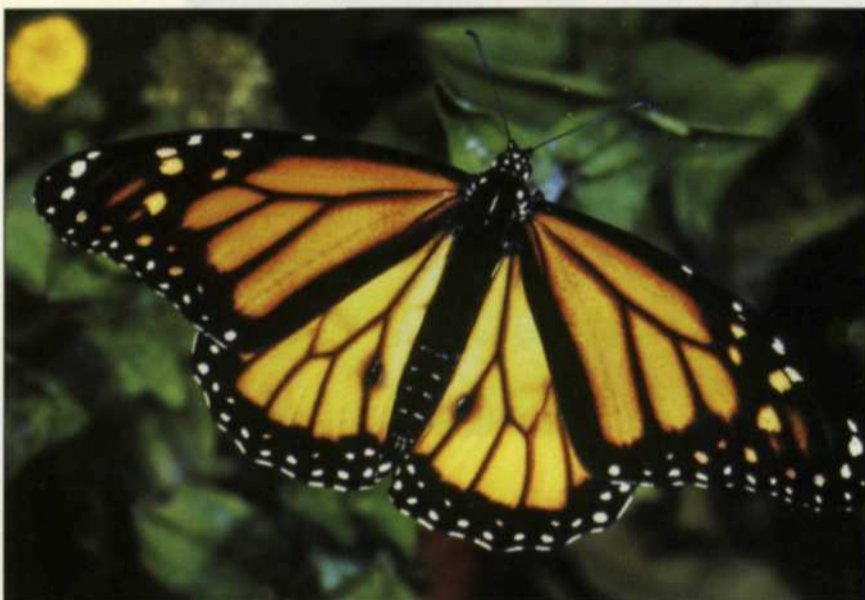
Fuji Astia 100