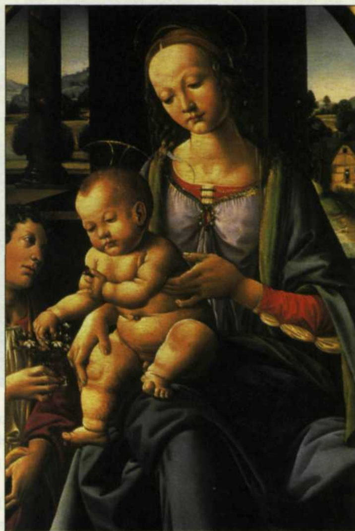
Fuji Astia 100