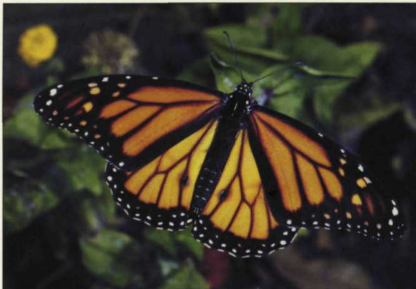
30-year-old color shift.