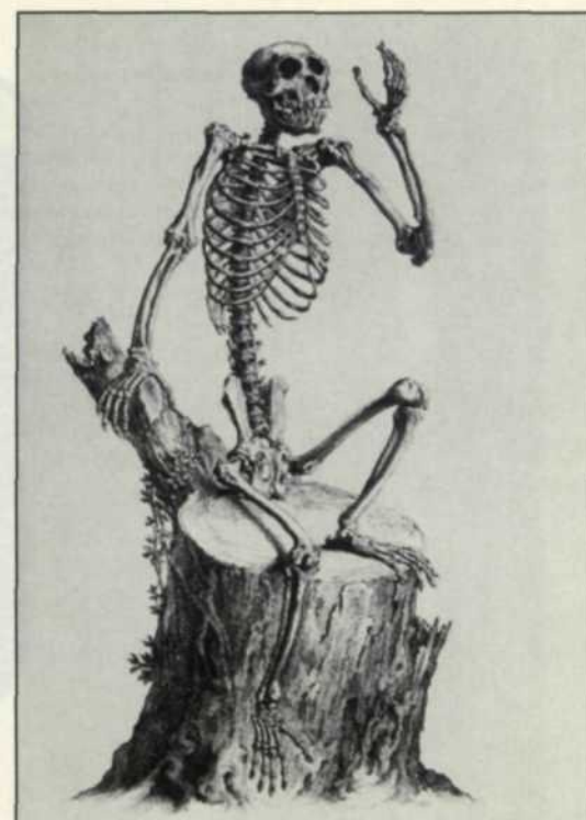
Fuji Astia 100

think, you don't even have to pay worker's comp on a computer!